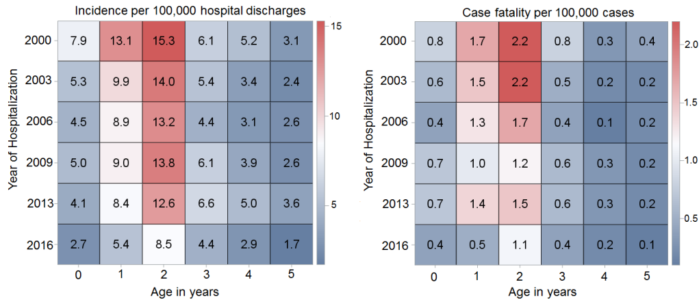
Figure 2. Drowning incidence and case fatality rates between 2000 and 2016 by age.

Conclusion: Prevention efforts to reduce drowning in children have been effective, as evidenced by an overall reduction of cases in the last decade. However, 2-year-old children, boys of all ages, and children in hospitals in the West and South continue to experience rates that exceed national averages. Prevention efforts targeted to reduce drowning in these high-risk groups are needed.